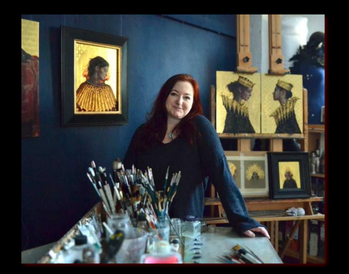
What the Heart Wants

The women in her paintings are sometimes idealized and often romanticized but they are always strong. She strives to paint contemporary people while maintaining a strong sense of history.