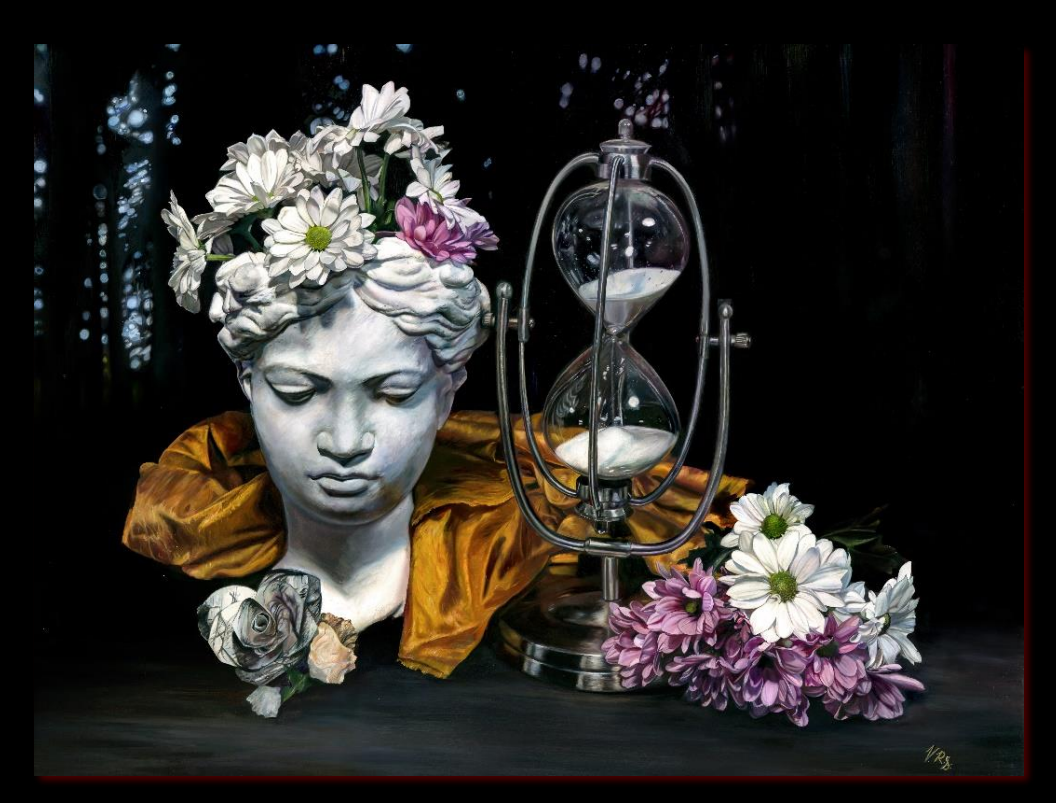
When Memories Blossom