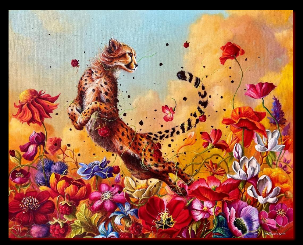
Here Comes the Sun

uses intensely saturated colors to illustrate the vibrancy of the world her characters inhabit.