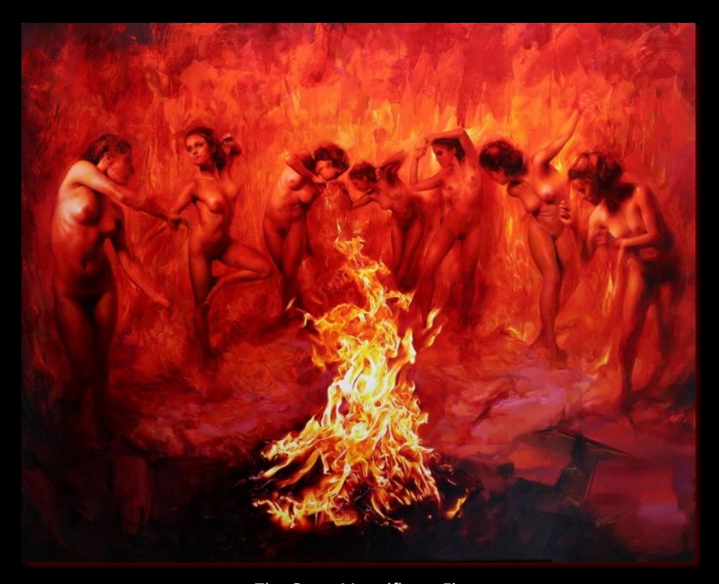
The Great Magnificent Fire

2011," the Grant for Culture Creators from the Marshal of Pomeranian, and a Certificate of Excellence Palm Art Award in Germany. The human figure deeply inspires her and uses realistic techniques to depict figures in a way that includes elements of symbolism and emotion.