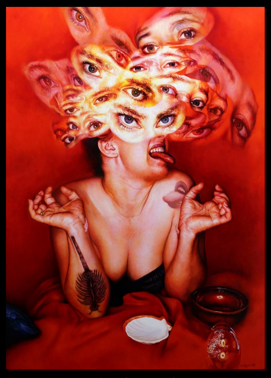
Creature by Anna Wypych

208 King Street Alexandria, VA 22314 703.739.9326 info@principlegallery.com 125 Meeting Street Charleston, SC 29401 843.727.4500 art@principlecharleston.com