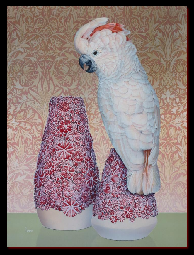
Tempus ad Requiem LVIII

ascribed to my subject matter. This symbolism—representing higher ideals, such as wisdom, awareness, and growth—may not be immediately obvious, yet I believe these messages reach the consciousness of those open to them."