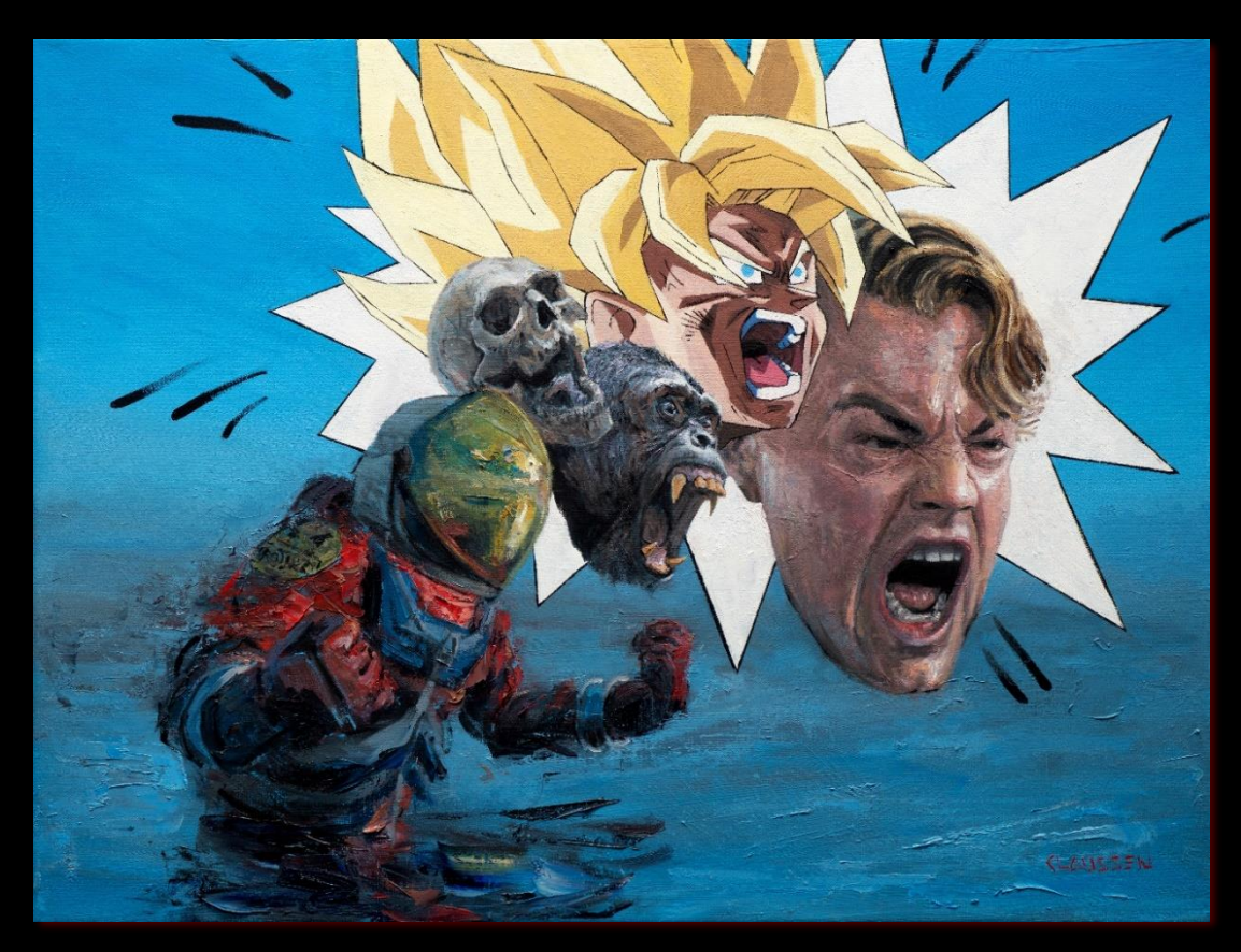
Make Use of Your Anger

Korea, Canada, and the USA. He lives and works in Lower Saxony, Germany.