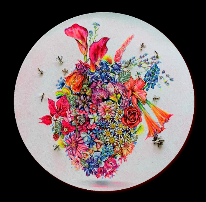
Catharsis: Primavera in My Heart

She uses oil painting to express universal values. Joy, beauty, and human relationships are shown through a fascination with what is widely understood as "oddity"—an aspect that can be noble, thrilling, strange, or inconvenient. She creates a dialogue about stereotypes and identity by underlining that every single one of us is different... and that it is a good thing.