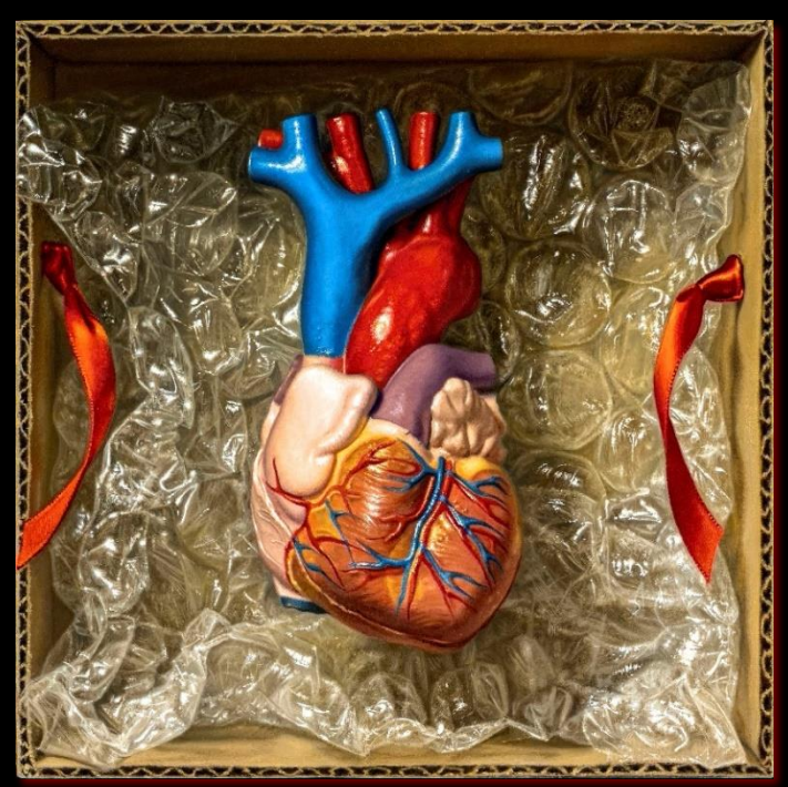
The Tell Tale Heart (Heart) diptych